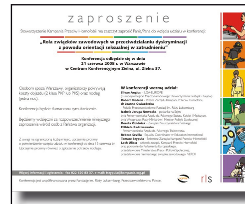
Invitation to the Trade Unions conference, 21st June 2008.